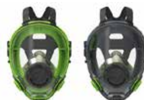
Full face masks BLS 5700 - BLS 5600