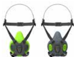
Half masks BLS 4000 S - BLS 4000 R